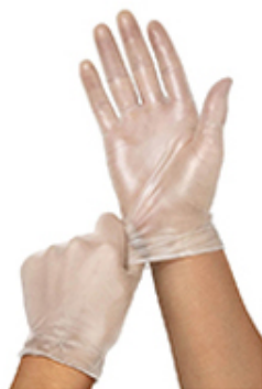
Disposable Vinyl Glove (SIS-G624)