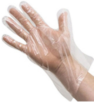
Plastic Glove (SIS-G625)