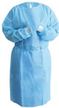
Isolation Gown (SIS-C1091)