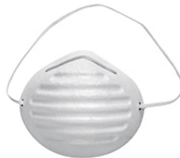
Dust Mask (SIS-SD102)