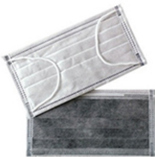
Activated Carbon Mask (SIS-C714)