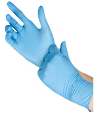
Disposable Nitrile Glove (SIS-G626)