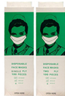
Nurse Mask (SIS-C713)