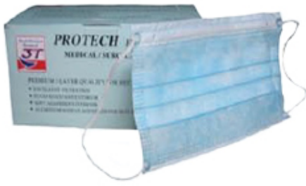
3 Ply Mask Earloop (SIS-C711E)