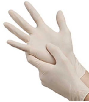
Disposable Latex Glove (SIS-G629)