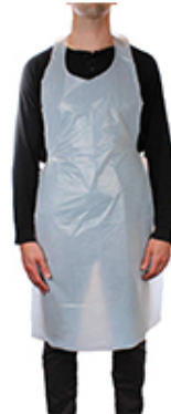
Plastic Apron SIS-C1053