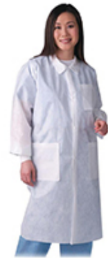
Protective Coat (SIS-C102)